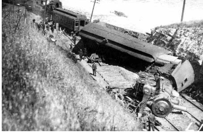
Second section of the Oregon Express #16.

Closer to home, a railroad tragedy took five lives. The place: the Southern Pacific tracks at the foot of Pinole Shores Drive where, on May 19, 1908, the Southern Pacific