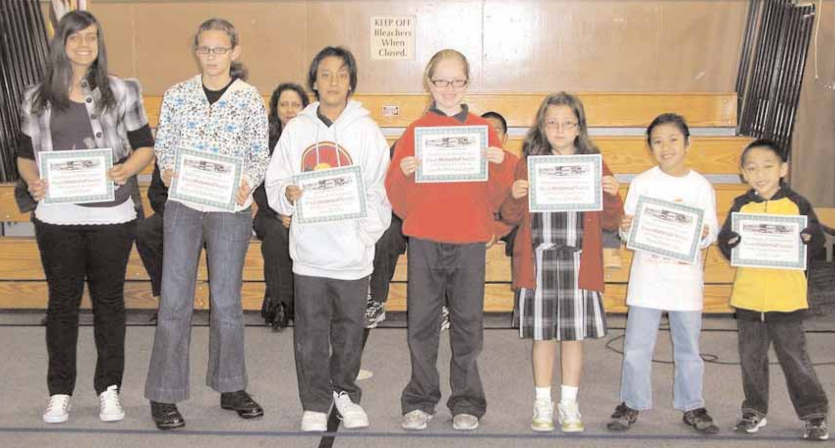
St. Joseph School grade winners