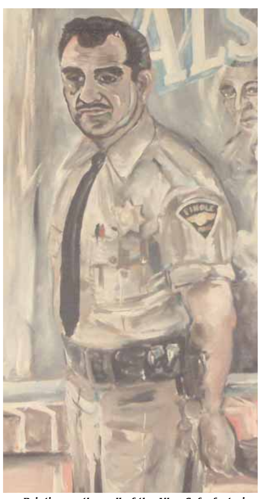
Painting on the wall of the Alley Cafe, featuring a policeman with the triangular patch.